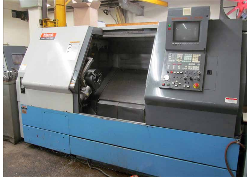
Mazak Quick Turn 35XS CNC Turning Center