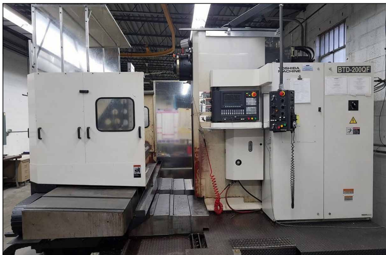
Toshiba Shibaura LTD-200QF CNC Horizontal Boring Mill