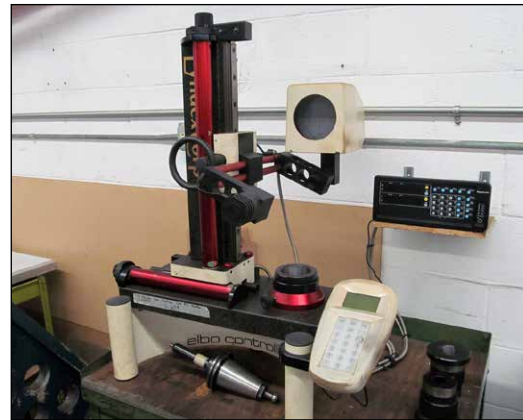
Elbo E238 Optical Tool Presetter