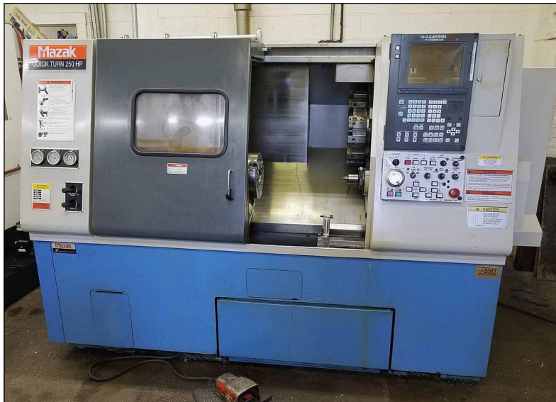
Mazak Quick Turn 250HP CNC Turning Center