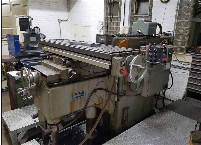
Eldorado M7439 Mega-Matic Universal Gun Drill