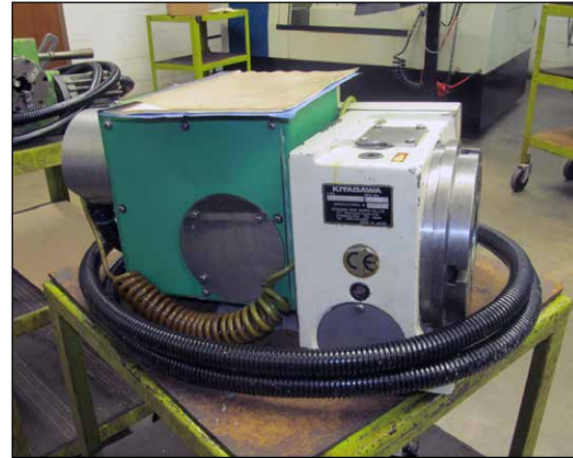
Kitagawa 4th Axis Rotary Table