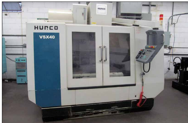
Hurco VSX-40 CNC Vertical Machining Center