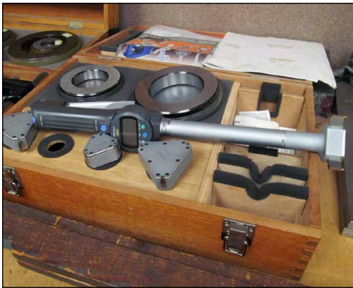
Mitutoyo Inspection Set