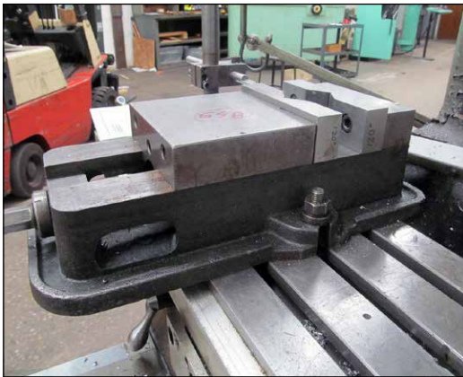
(Over 12) Machine Vises