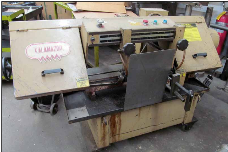
Kalamazoo HBS-1018 Horiz. Band Saw