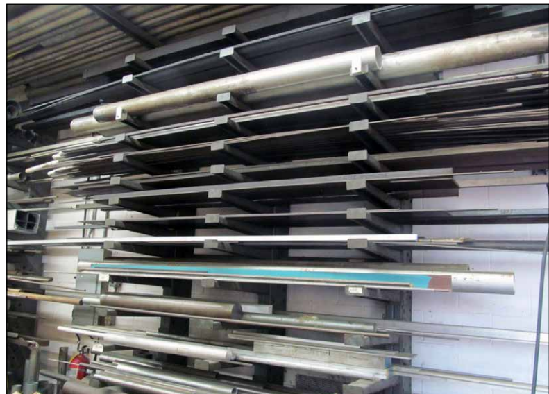
Large Quantity of Steel Stock of Various Materials, Sizes and Lengths