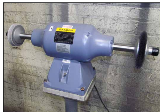
Baldor 3/4 HP D.E. Bench Grinder