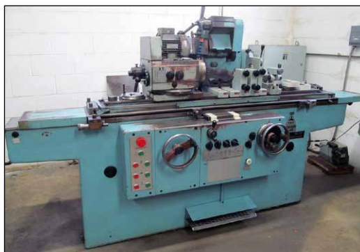
TOS Hostivar BU28-1000 Univ. Cyl. Grinder