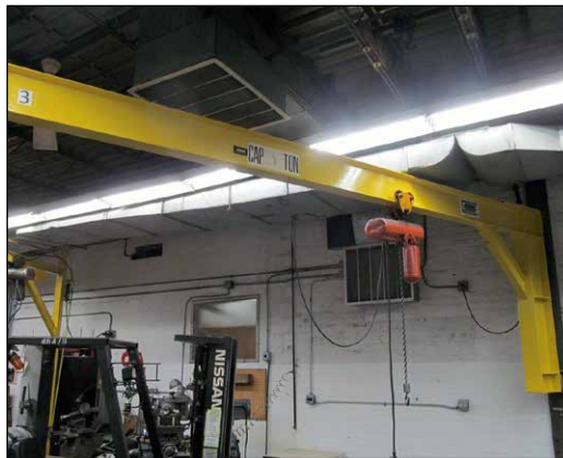
CM Lodestar 1/2 Ton Cap. Jib Crane