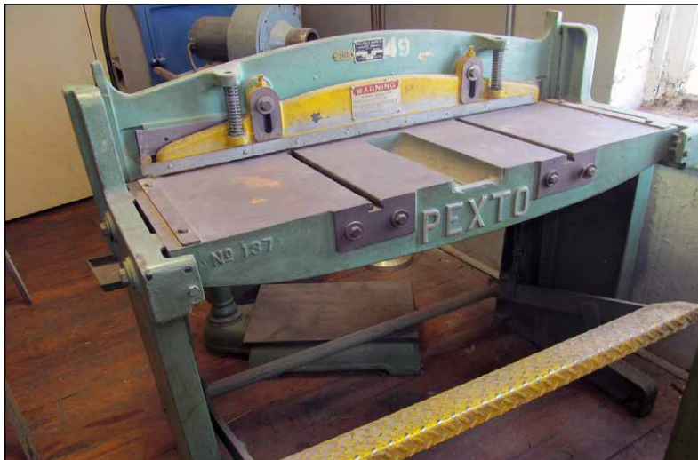
Pexto Manual Shear