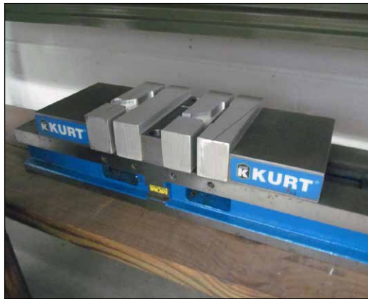
Kurt 6 in. Dbl. Machine Vise