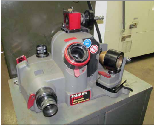
Darex XT3000 Xpandable Sharpener