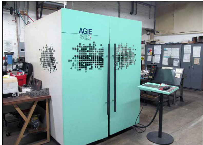
Agie AgieCut Classic 2S CNC Wire EDM