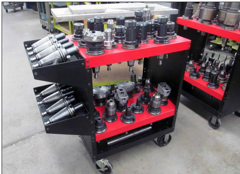
50-Taper, 40-Taper & 30-Taper Tool Holders