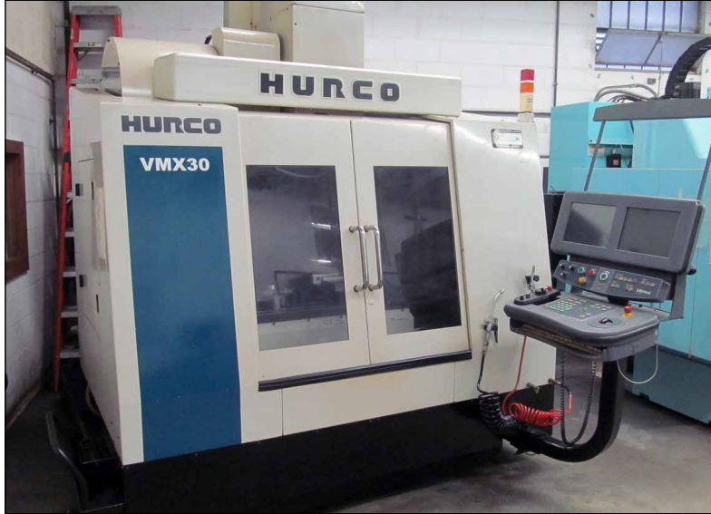
Hurco VMX-30 CNC Vertical Machining Center