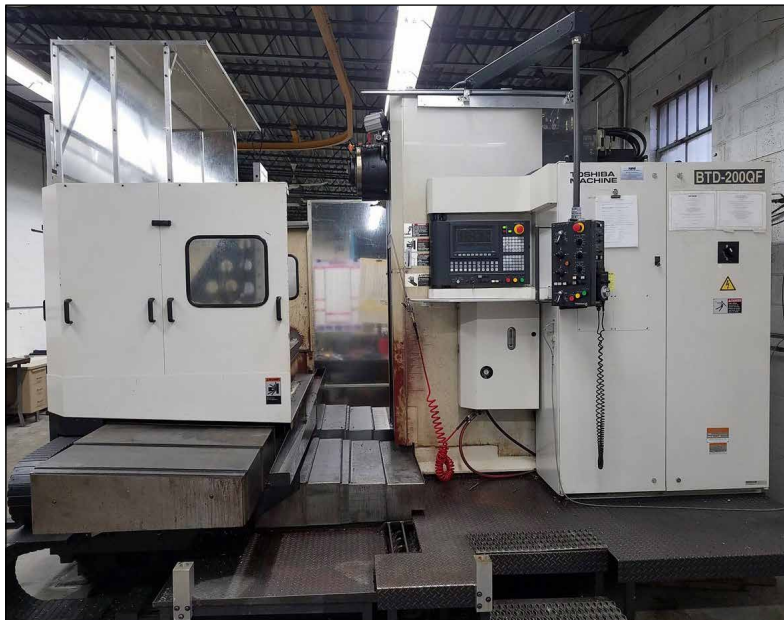
Toshiba Shibaura BTD-200QF CNC Horizontal Boring Mill