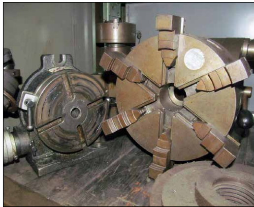
View of Chuck/Rotary Table