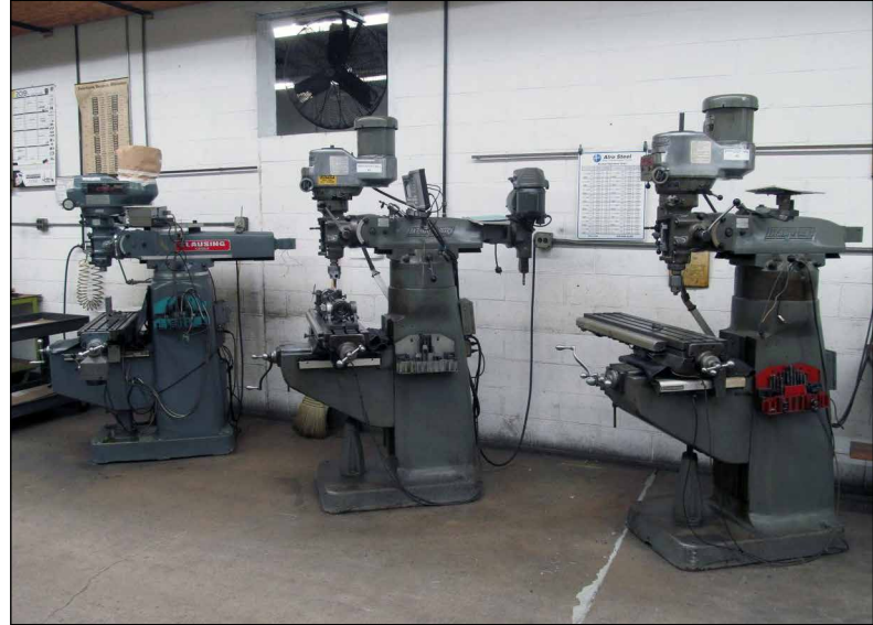
View of Bridgeport Mills