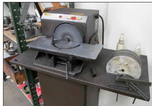
Glendo Accu-Finish Diamond Finisher