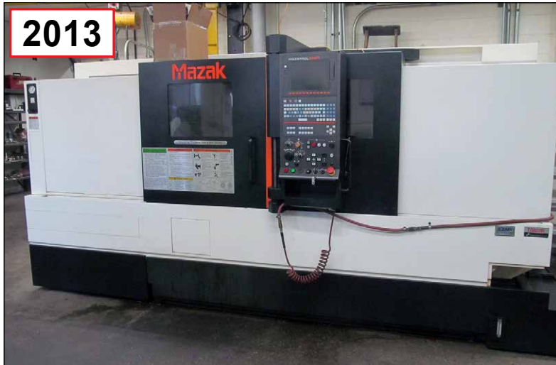
Mazak Quick Turn Smart 300 CNC Turning Center