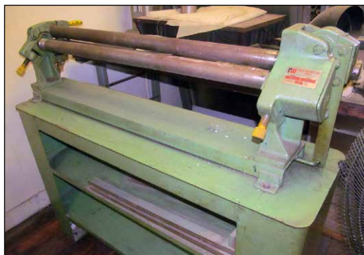
Roper Whitney 3-Roll Bender