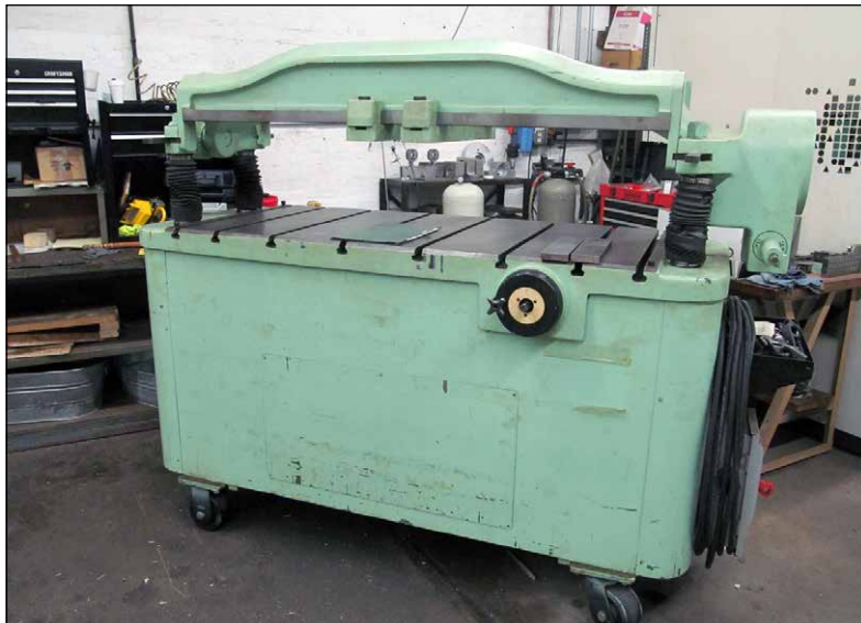
Hansford 20-Ton Mdl. 1021 Die Handler/Tryout Press