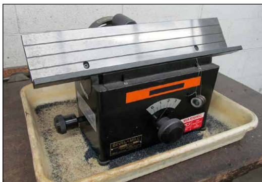
Heck Model VA400 Bench-Top Bevel-Mill