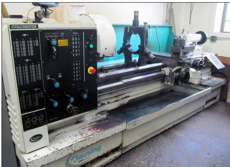
Clausing Colchester 22/28" x 90" Gap Bed Lathe