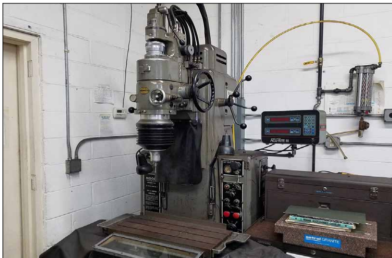
Moore No. 3 Precision Jig Grinder