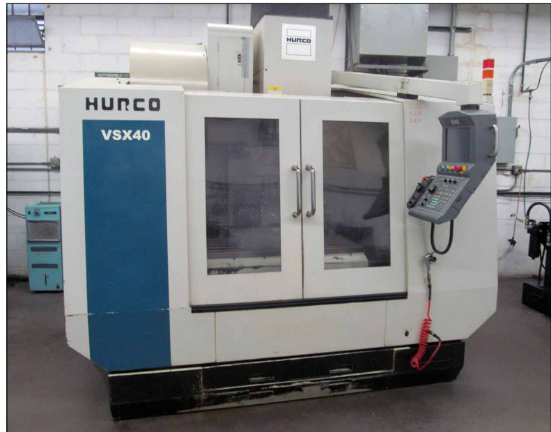
Hurco VSX-40 CNC Vertical Machining Center