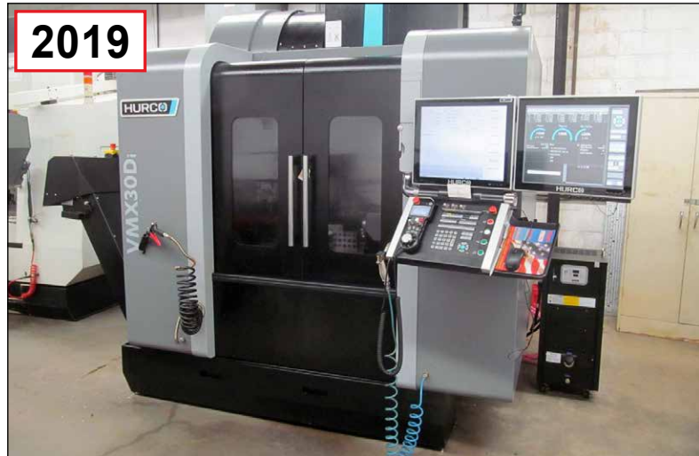
Hurco VMX30Di CNC Vertical Machining Center