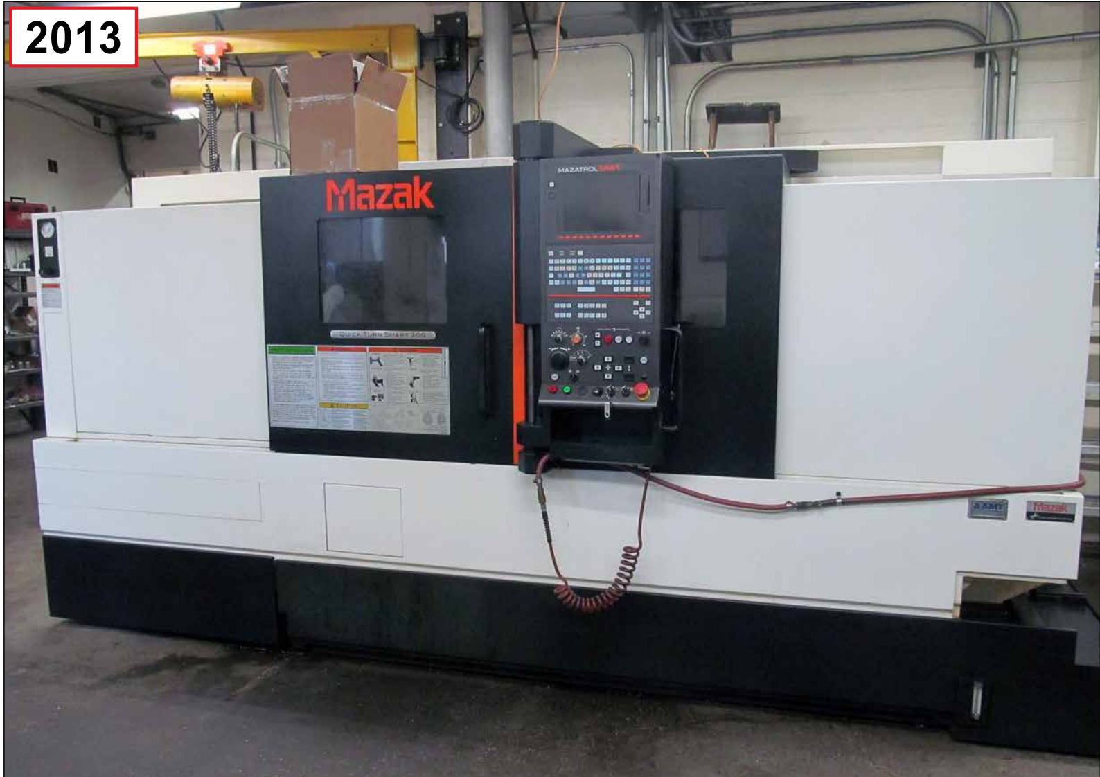
Mazak Quick Turn Smart 300 CNC Turning Center