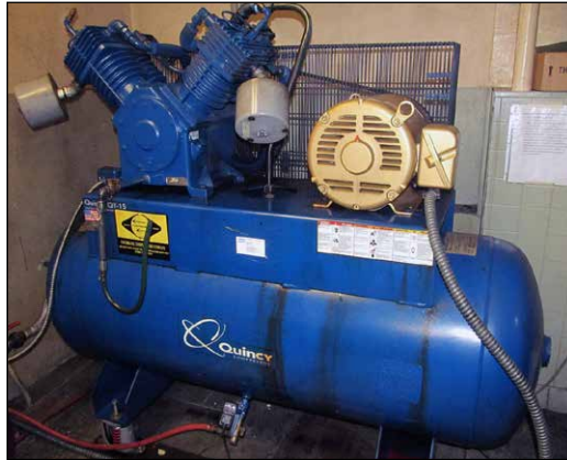
Quincy 15-HP Mdl. QT-15 Air Compressor