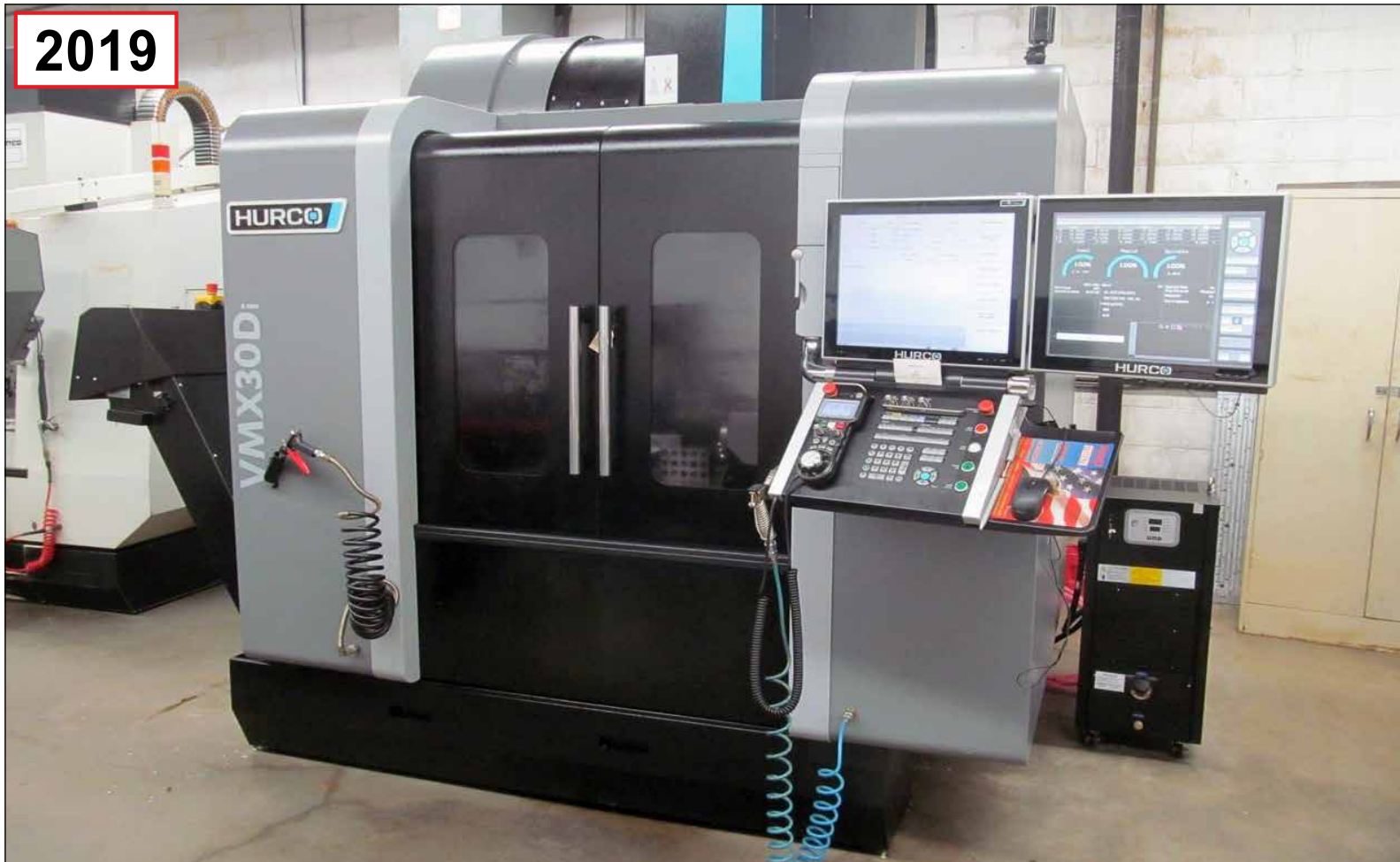
Hurco VMX30Di CNC Vertical Machining Center