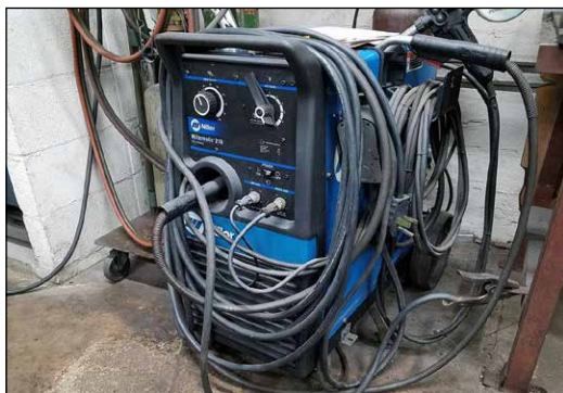
Miller Millermatic 210 Wire Welder