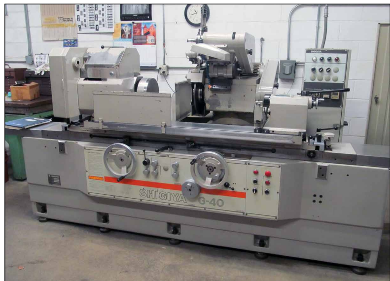
Shigiyu GU-30(40)B-100A Prec. Universal Cylindrical Grinder