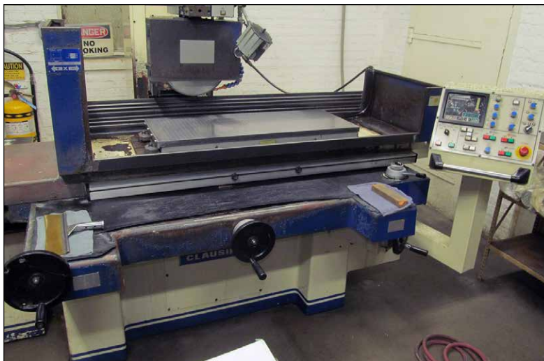
Clausing CSG-1640ASD Auto. Grinder