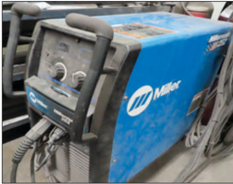
MILLER MILLERMATIC 252 WELDER