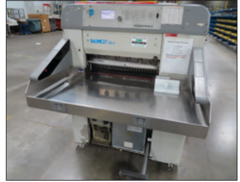
BAUM PAPER CUTTER MODEL BAUMCUT 26.4