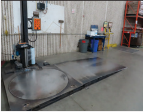
ORION ROTARY STRETCH PALLET WRAPPER