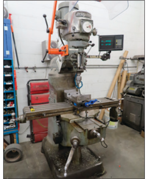
BRIDGEPORT 1.5 HP VERTICAL MILLING MACHINE