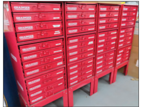
GRAINGER HARDWARE CABINETS