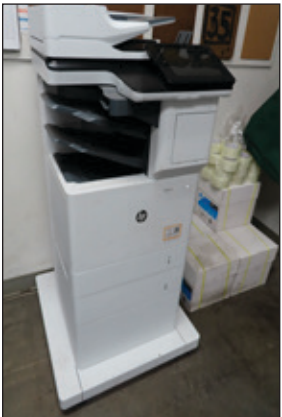
HP LFREC V01 OFFICE CENTER