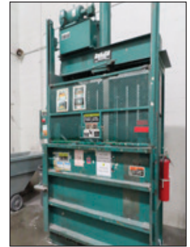
SELCO VERTICAL BALER MODEL VI-5- LH