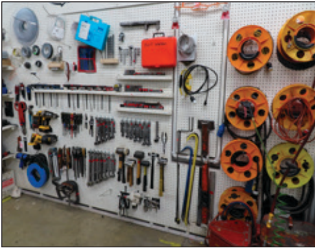
MAINTENANCE DEPT TOOLS