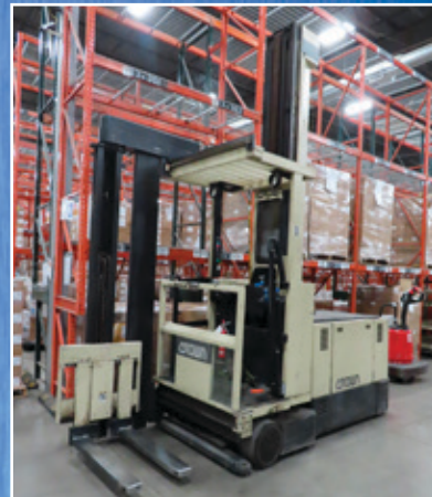
Crown Electric 3000 lb Electric Turret Swing Reach Forklift Model 30TSPN