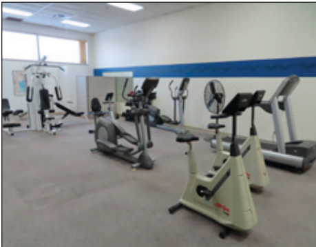
VIEW OF FITNESS EQUIPMENT