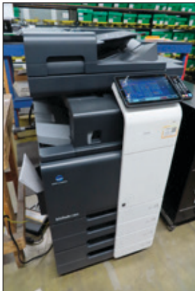
KONICA MINOLTA BIZHUB C360I

THIS BROCHURE IS A PARTIAL LISTING. COMPLETE LOT CATALOG, TERMS OF SALE & REGISTRATION AT WWW.THOMSAUCTION.COM 18% Buyer's Premium