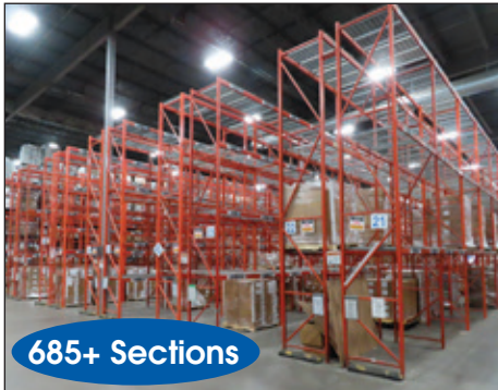
HEAVY DUTY ADJUSTABLE PALLET RACKING