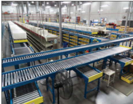
VIEW OF SIEMENS HIGH CAPACITY SORTING SYSTEM