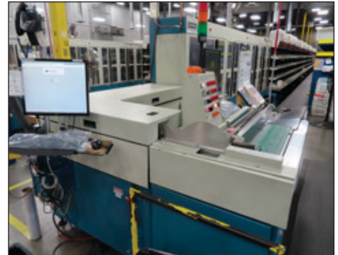
VIEW OF SIEMENS HIGH CAPACITY SORTING SYSTEM