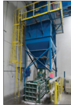
MARIN ENGINEERING HORIZONTAL BALER MODEL 72