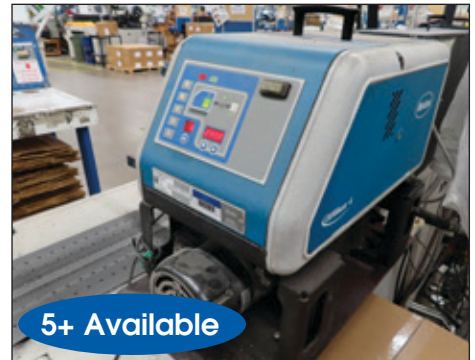
ITW DYNATECH HOT GLUE SYSTEM