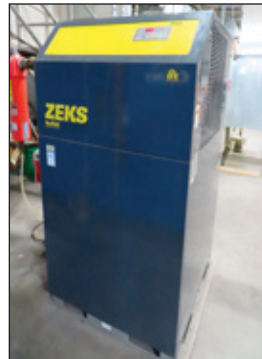
ZEKS COMPRESSED AIR DRYER MODEL 600HSFA 400