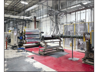
Mega 72 in. w/200-Series PET Sheet Line