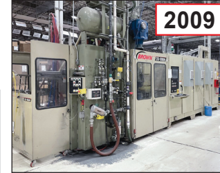
Brown 50 in. CS-5500 In-Line Thermoformer

Unique Opportunity to Acquire Large Capacity PET Sheet Production & Thermoforming Packaging Equipment Featuring: Plastic In-Line Thermoformer's, PET Sheet Line, Crystallizer Hopper Dryers, Trim Presses, Punch Presses, CNC Vertical Machining Centers, Flatbed Lasers, Granulators & Grinders, Trimmers, Labeling Lines, Blenders, Hoppers, Dryers, Gas Packs, Blowers, Silo's, Machine Shop, Chillers, Air Compressors, Material Handling, Fork Lifts and Plant Support Equipment.