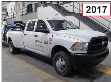
Dodge RAM 3500 HD Dually Pick-Up Truck