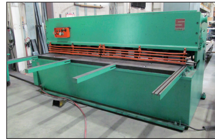
Summit 1/4 in. x 10 ft. 10x1/4SH