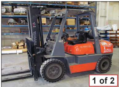
(2) Toyota 7,000 lb. Cap. LP Fork Lift Trucks