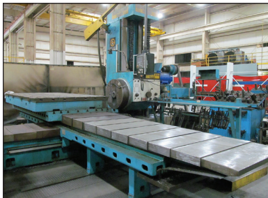
Giddings & Lewis Fraser A-1308 CNC HBM