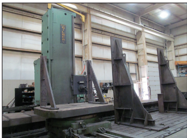
Cincinnati Gilbert 6 in. J Floor Type HBM