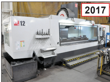
2017 Haas 3-Axis VF-12/50 CNC VMC

Call us today for a confidential consultation at 847.272.0440 or email: charlie@winternitz.com