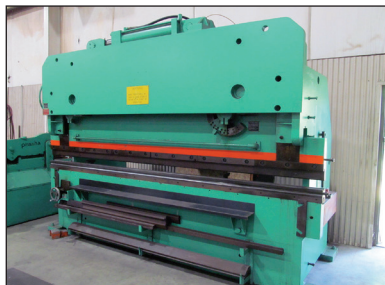
HTC 55-12H Hydraulic Press Brake